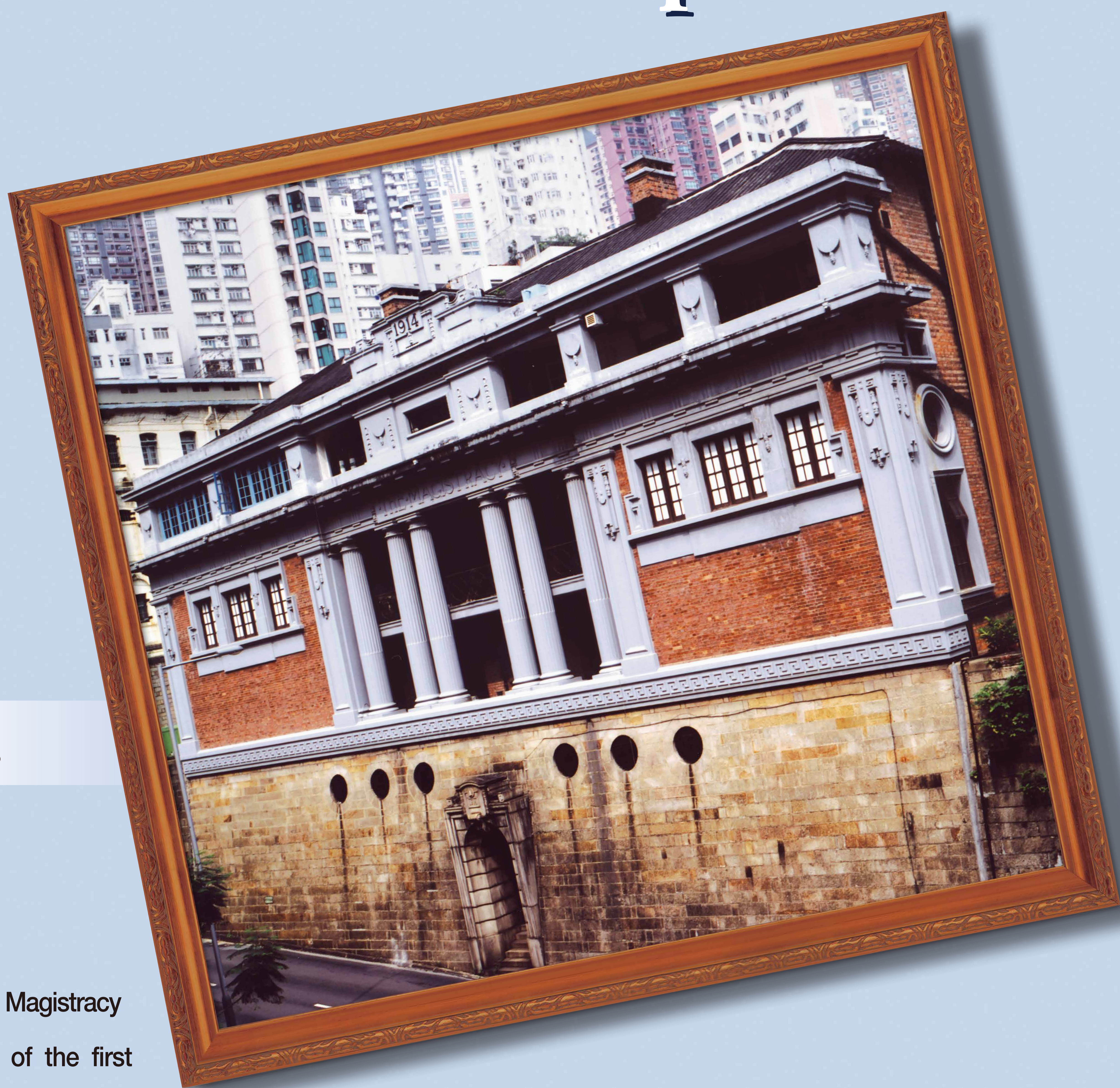
二零零五年的前中央裁判司署 Former Central Magistracy in 2005

T he Former Central Magistracy was constructed on the site of the first magistracy in 1914. At that time it housed two courts, whose two magistrates served the entire Colony. The building is a fine example of neo-classical architecture with its front and rear designed to impress the public of the majesty of the law. An important design consideration was for the secure movement of prisoners to and from the Magistracy which was achieved by means of separate corridors. These led either back to prison, the police station or to the open air, depending on the verdict at the prisoner's trial.